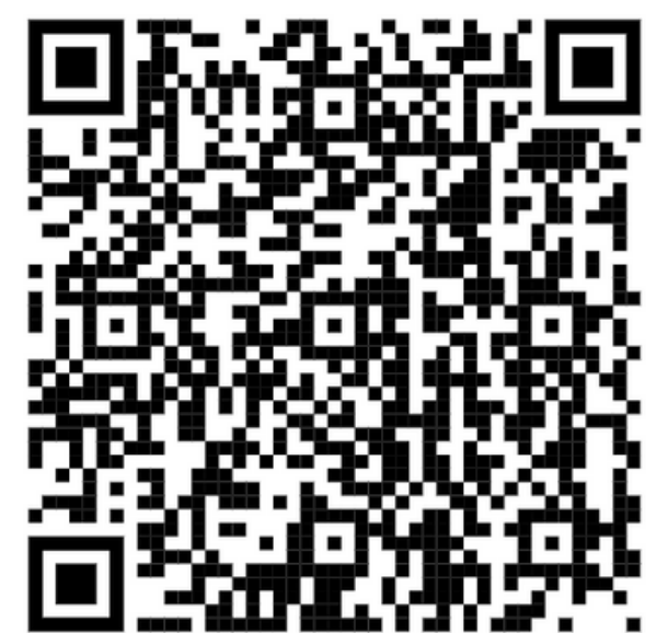
Supporting mobilisation after hip fracture